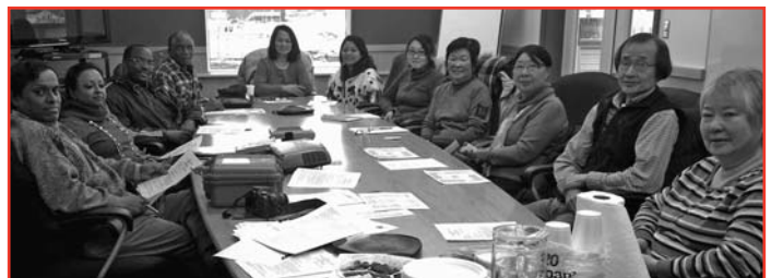
The Racially Visible Committee gathers for their monthly meeting.

Please see the "Members" section of the YEU website to download an information brochure and learn how to participate in this vibrant and effective activist organization.