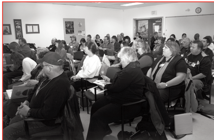
More than 50 delegates and 15 presenters work for two full days to enhance the skills needed to better represent YEU members.