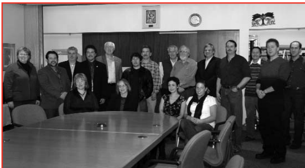
Representatives from a variety of organizations gathered at Yukon College for the signing of a Skills Canada-Yukon College memorandum of understanding.