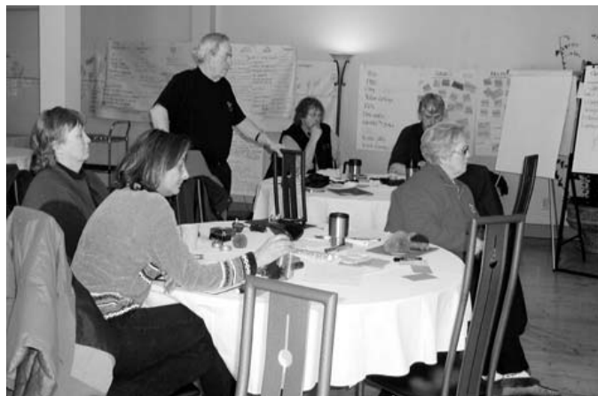
The YEU Executive sets priorities for the coming year.